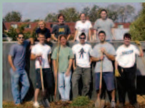
ESF's Mollet Club